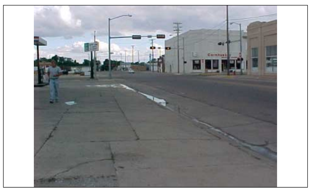
PICTURE OF: Photograph 4: Standing on the northwest portion of the site looking off-site to the northwest.