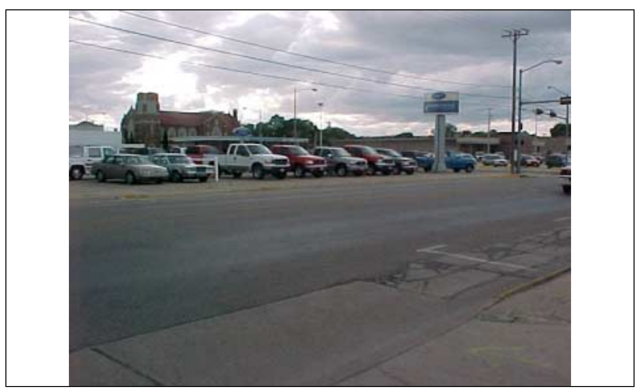
PICTURE OF: Photograph 2: Standing on the northwest portion of the site looking off-site to the northwest.