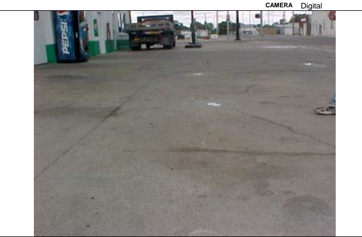
PICTURE OF: Photograph 5: Standing on the northwest portion of the site looking south across the site.

TERRACON PROJECT NO 05037038-Task 3 DATE OF PHOTOGRAPH