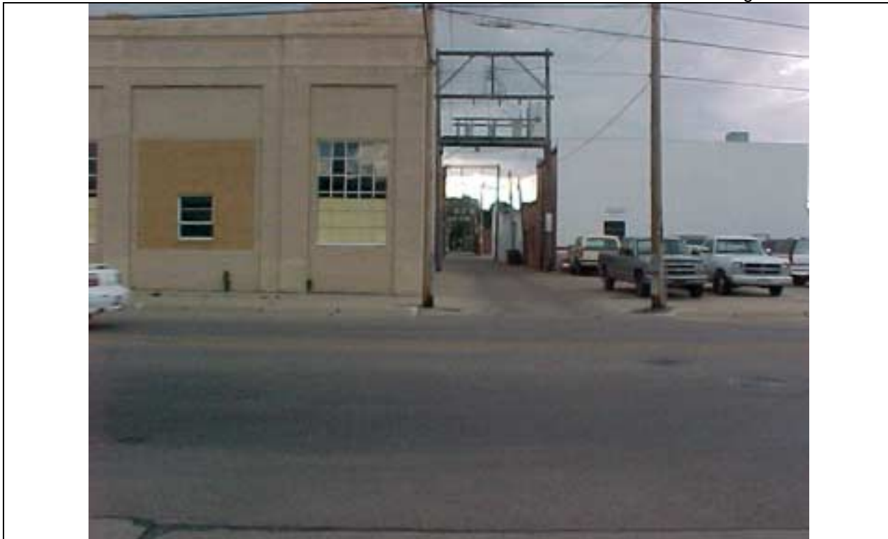
PICTURE OF: Photograph 3: Standing on the northwest portion of the site looking off-site to the west.