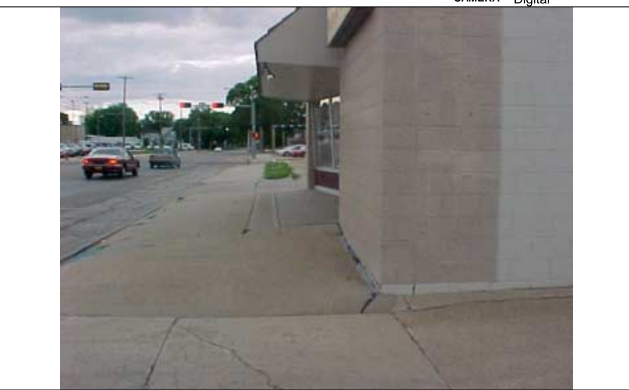
PICTURE OF: Photograph 1: Standing on the northwest portion of the site looking off-site to the north.

TERRACON PROJECT NO05037038-Task 3DATE OF PHOTOGRAPH6/1/2004CAMERADigital