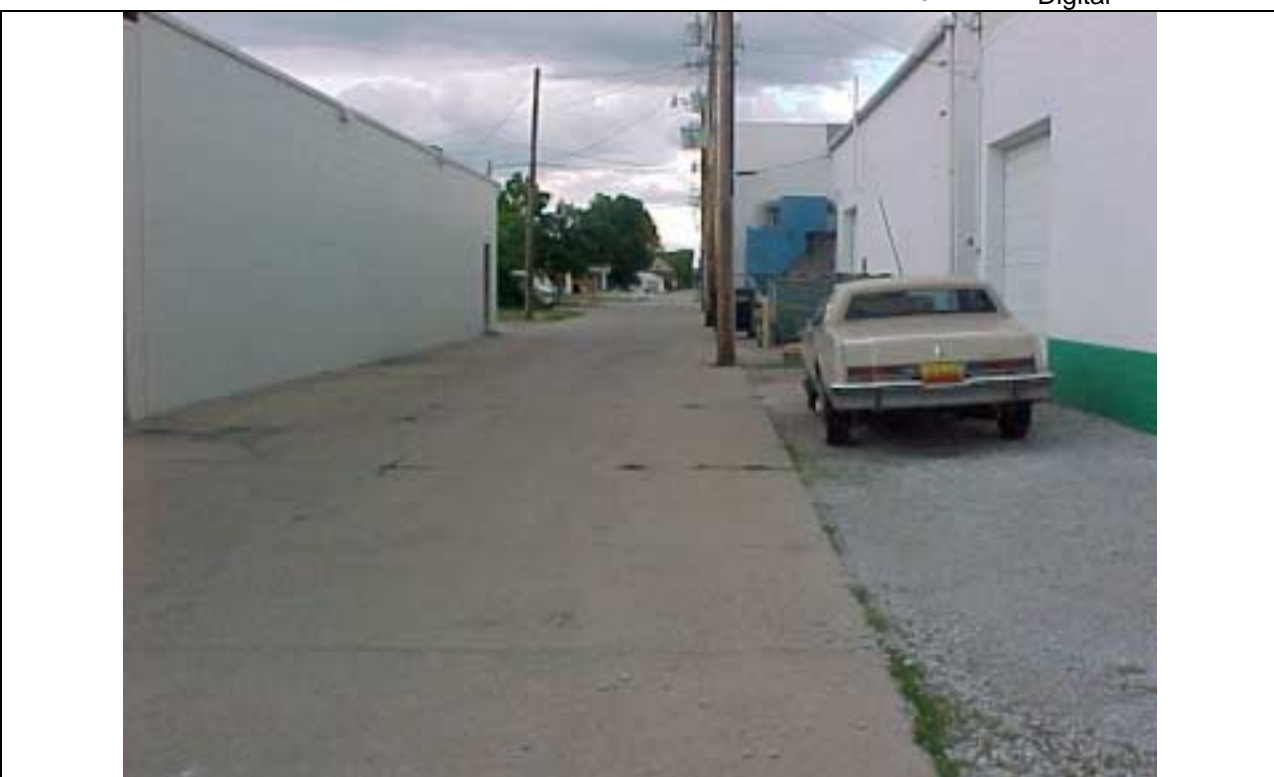
PICTURE OF: Photograph 7: Standing on the northwest portion of the site looking off-site to the east.