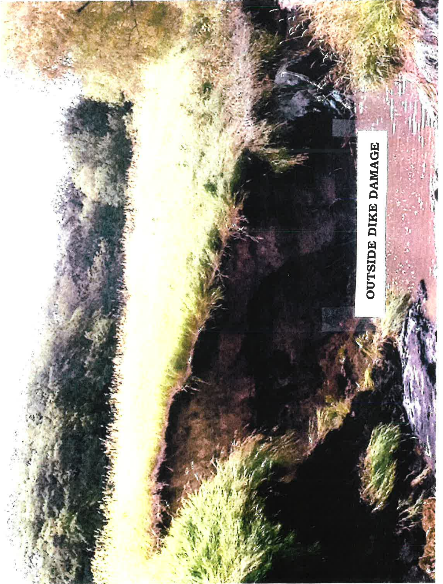
OUTSIDE DIKE DAMAGE