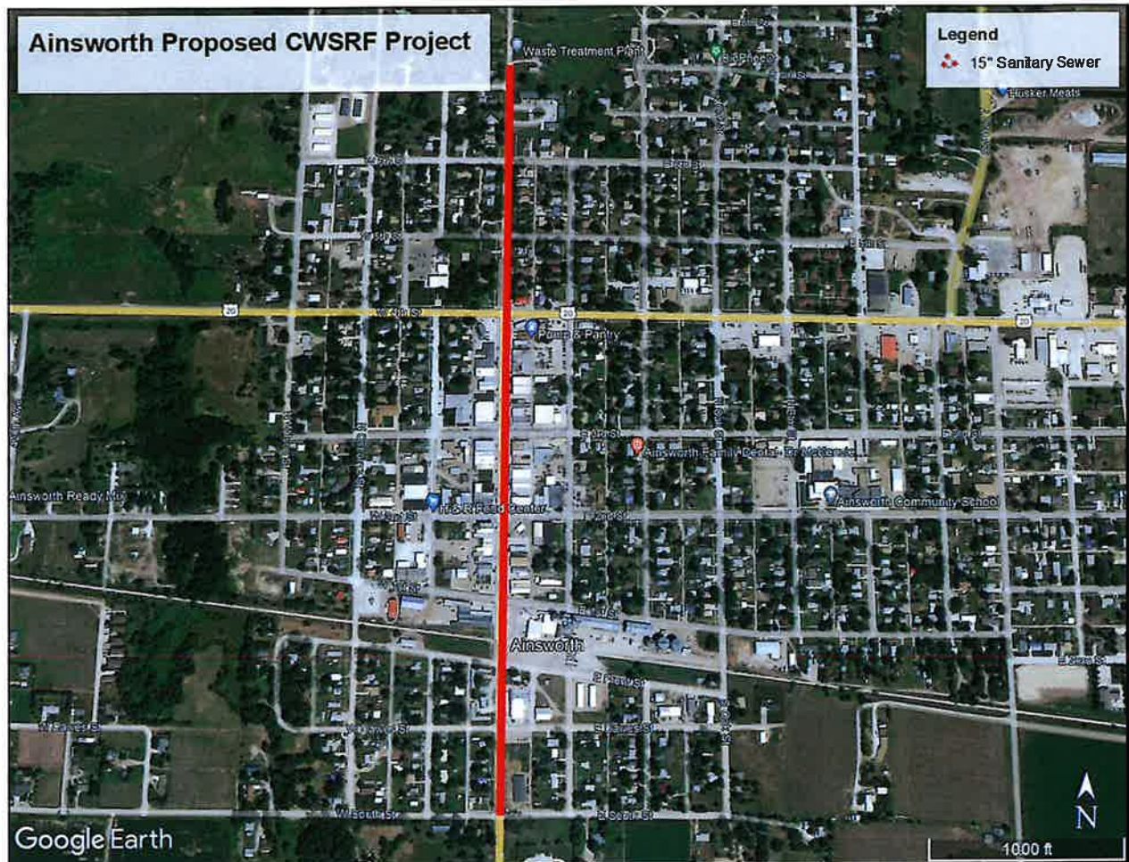
Figure 2 – Approximate Location of City of Ainsworth’s Proposed 15 Inch Sewer Main Replacement