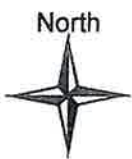
Figure 1U Location Map & Service Area Wauneta, Nebraska

Prepared By: MA Miller & Associates CONSULTING ENGINEERS, P.C. McCook, Nebraska